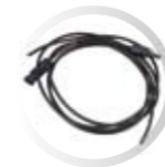
MC4 connector for easy panel connecting